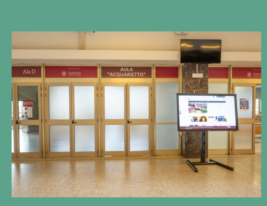
Room: Acquarietto - Ground floor