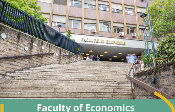
Faculty of Economics via Castro Laurenziano 9